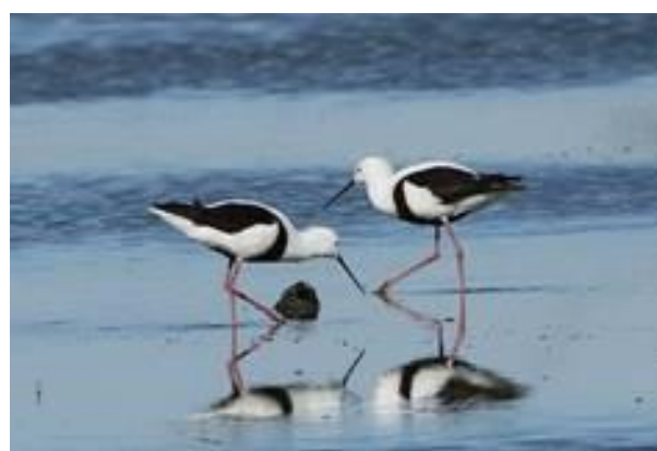
Photo 1: Ducks and sandpipers Photo 2: Banded Stilt